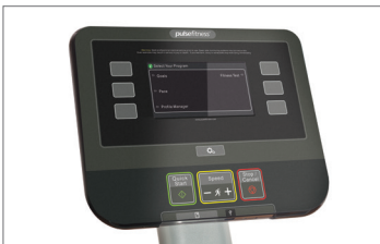
LED Backlit Console