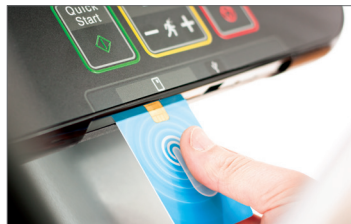
Optional Smart Technology