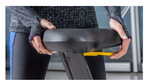
Comfortable seat with single-handed adjustment for quick and easy positioning.

The R Series Upright Bike combines an intuitive exerciser experience, results-driven design and an inviting modern aesthetic. It is an effective cardio solution for any exerciser.